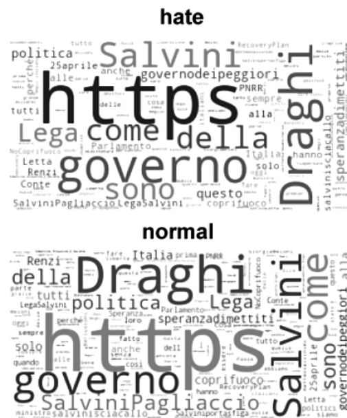
Figure 3: Wordclouds of the unigrams most associated to the normal and hate classes respectively. It shows a substantial overlap among the top unigrams in the two classes.

We used Scikit-Learn to compute a majority baseline with a dummy classifier, that assigns all the instances to the most frequent class (normal tweets), a naive bayes classifier, a decision tree and Support Vector Machines (SVMs). The best performance for the classification of hate speech has been achieved with the SVM classifier, that has a very high precision (0.94) and poor recall (0.60). All the algorithms a The results are in line